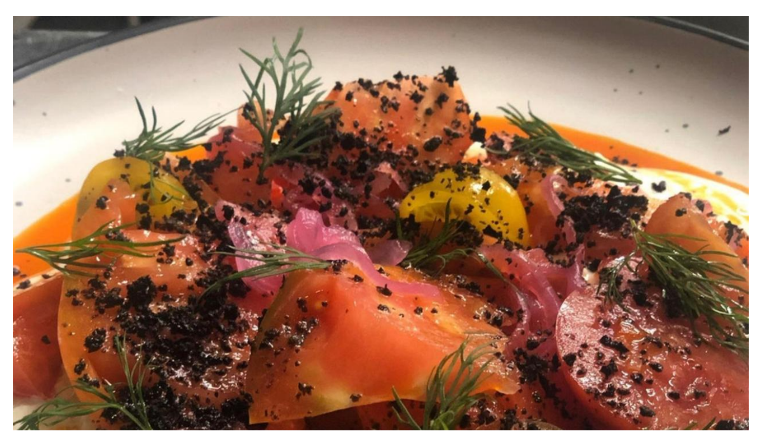
The Mexican in Macrossan St at Port Douglas combines local produce with fresh fish and seafood to create a weekly Ceviche del Dia.

Fresh, friendly, vibrant, and high energy, with a hip hop playlist that matches the $6 house infused tequila shots, which rotates flavours weekly, is the experience on offer at The Mexican.