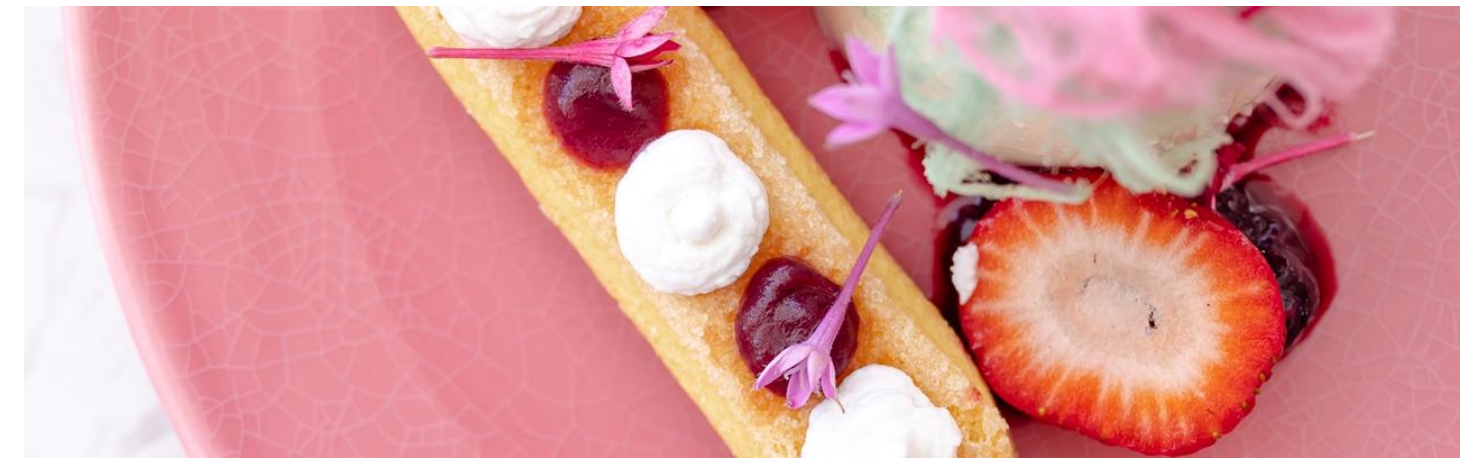
A delectable dessert at Flynn's Italian.

Signature dishes include antipasto burrantina with 24-month aged Tomewin Farm prosciutto, and homemade gnocchi veal ragout.