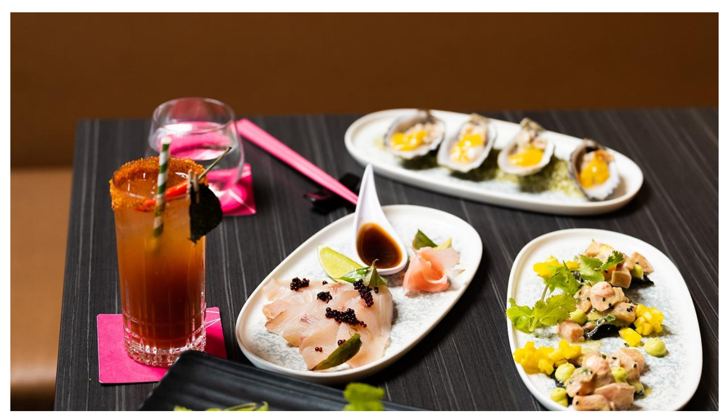
Paper Crane offers a modern Asian fusion experience that makes the most of Tropical North Queensland's fresh produce.

Highlighting Japanese, Chinese, Korean, Thai, and Vietnamese inspired dishes, the aromatic flavours create a vibrant alfresco dining experience overlooking the Coral Sea.