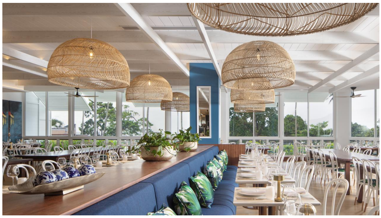
Flynn's Italian Restaurant at Crystalbrook Flynn.

Flynn's Italian has a renowned house made limoncello.