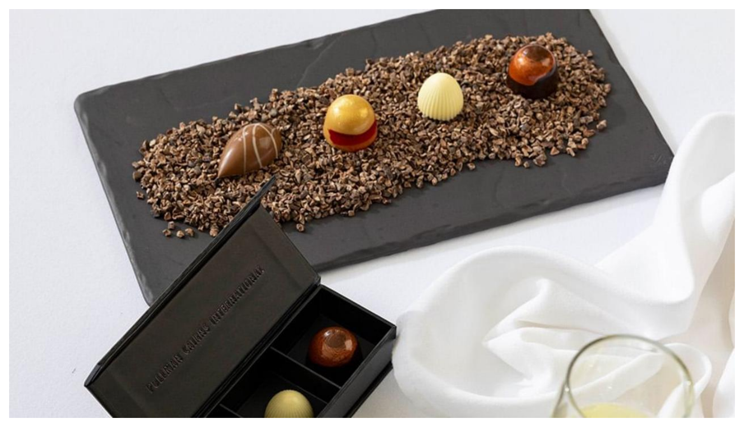
Award-winning pastry chef Ashleigh Otto has created a selection of signature truffles, exclusively available to purchase from the lobby at Coco's.

Mr Otto, a multiple award-winning pastry chef, has created a selection of truffles, exclusively available to purchase from the lobby at Coco's.