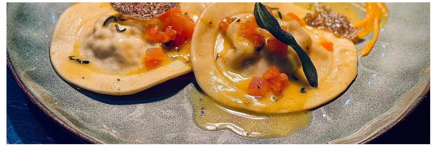
Hand made salmon and zucchini ravioli with butter and sage sauce served on a pumpkin puree at Il Chiosco at Trinity Beach.

Best restaurants and cafes Far North Queensland, Cairns, Port Douglas, Kuranda | The Cairns Post