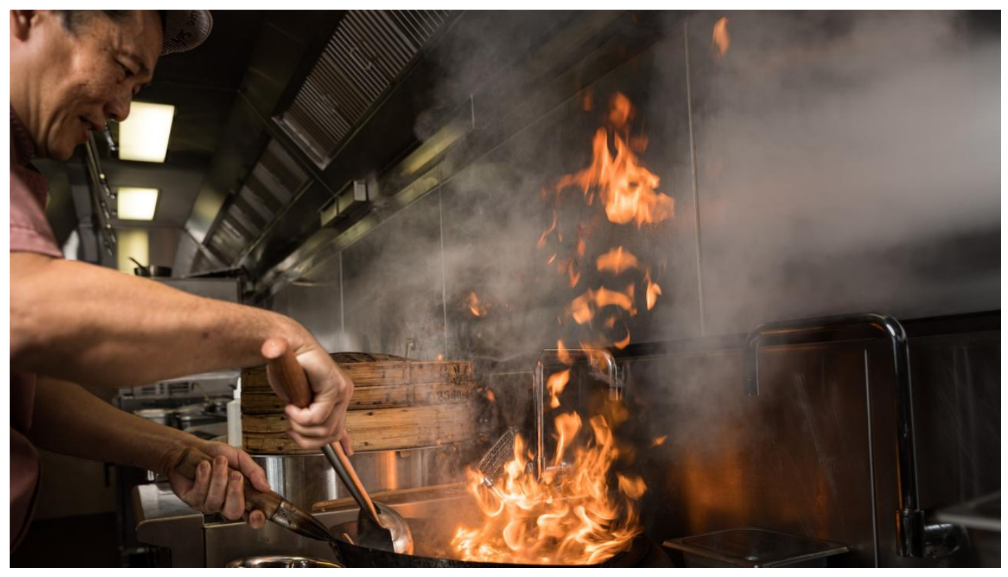
Paper Crane offers a modern Asian fusion experience that makes the most of Tropical North Queensland's fresh produce.

Paper Crane offers a modern Asian fusion experience that makes the most of local fresh produce.