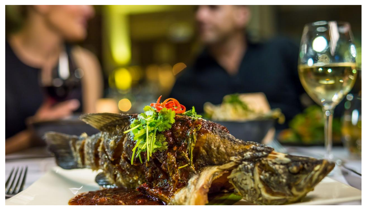
Tamarind restaurant at Pullman Reef Hotel Casino.

Tamarind is open for dinner Tuesday to Saturday with dining from 5.30pm to 9.30pm.