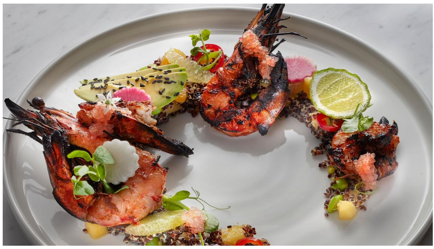
A delectable meal at the Treehouse Restaurant at Silky Oaks Lodge, outside Mossman.

Guests can opt for two or three courses, with entree highlights including kingfish tataki or duck larb salad while mains might include tempura reef fish or barbecued tiger prawns.