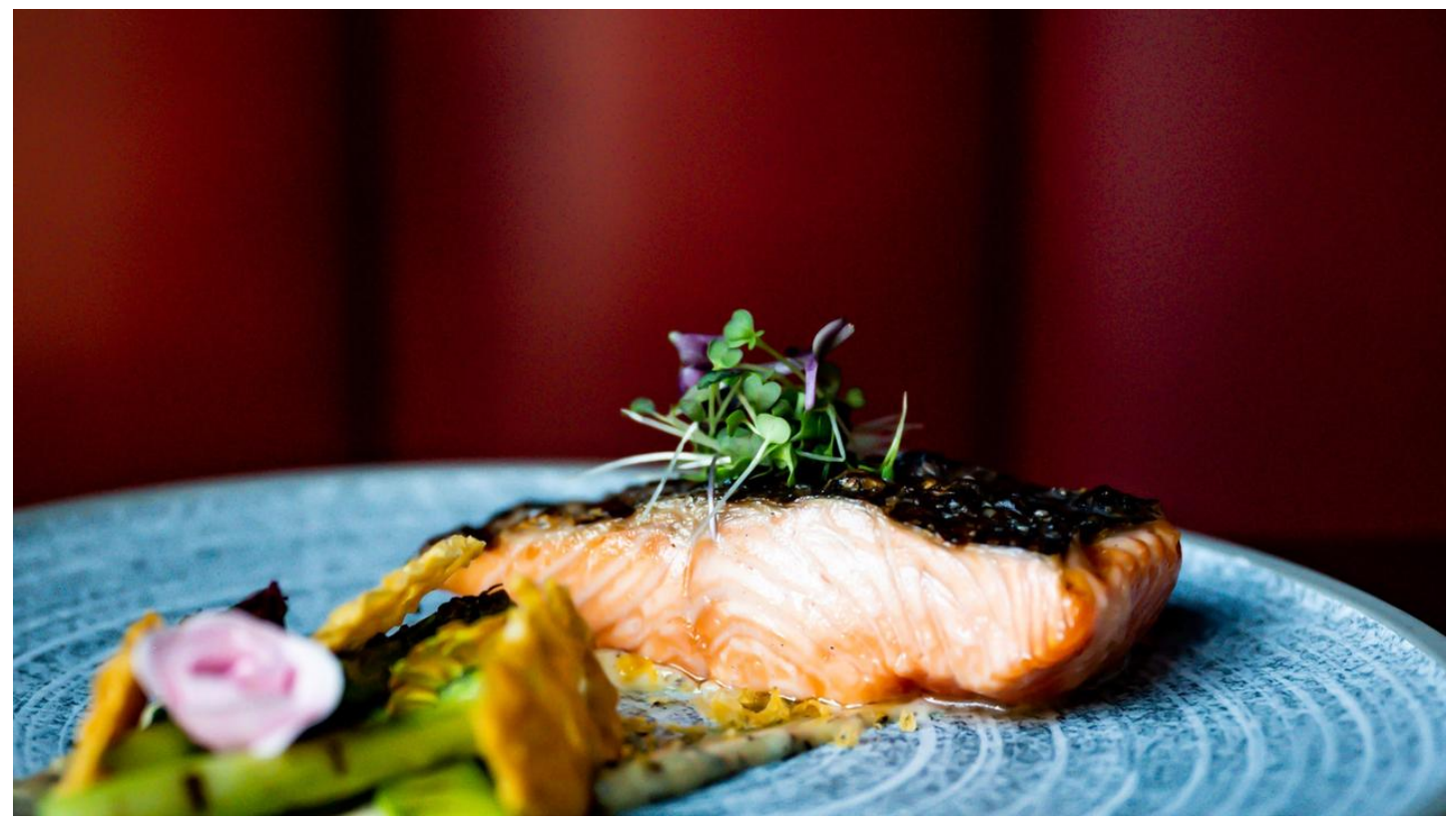
CC's Bar & Grill featured in Delicious top 100 restaurants for Queensland for 2022.

More than 80 per cent of produce, including steaks, is sourced from within a three-hour drive, primarily from the Atherton Tablelands, in line with Crystalbrook's eco-sustainability ethos.