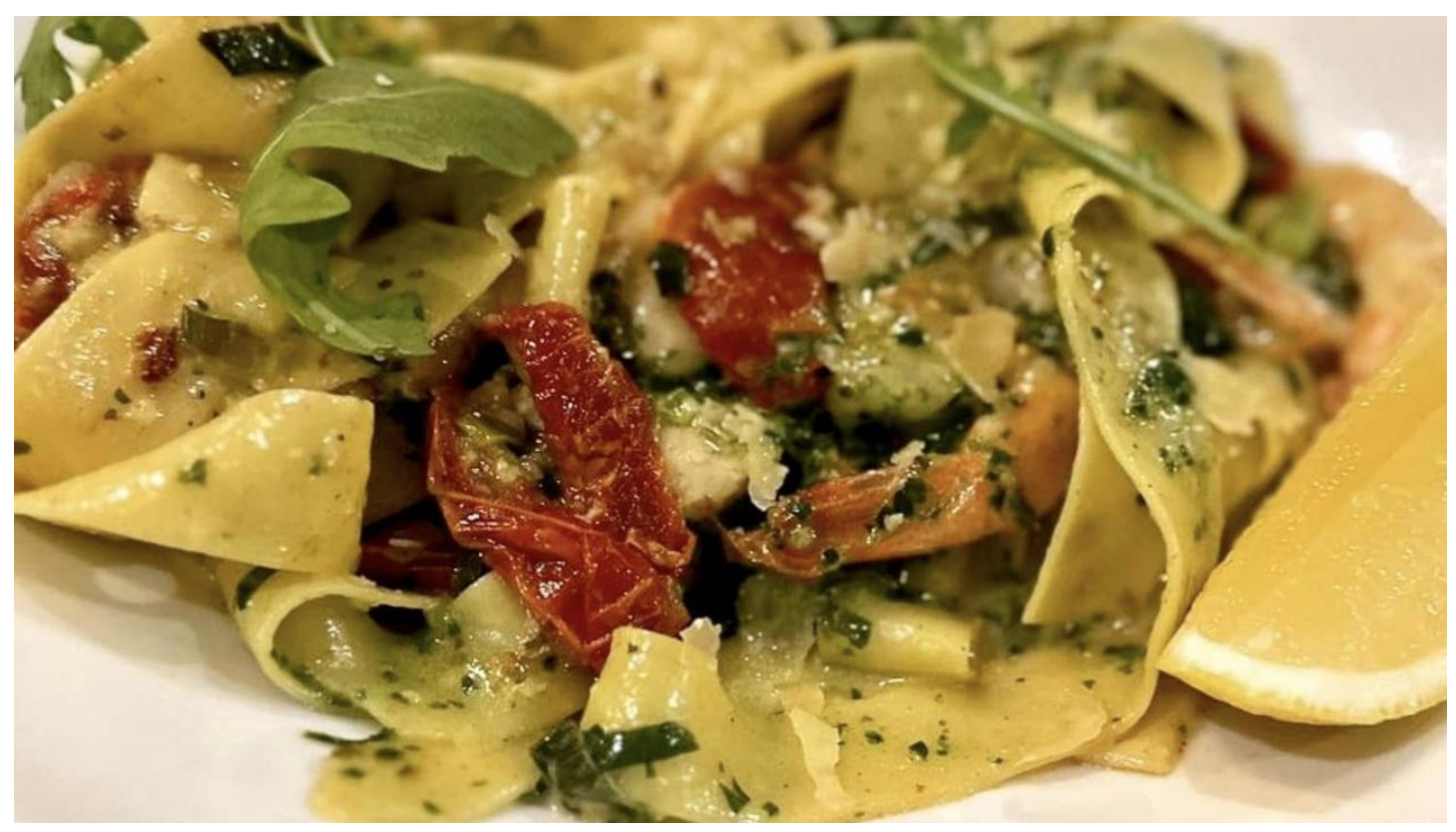
A must-try for seafood pasta lovers at Dundees on the Waterfront, is the prawn & scallop pappardelle. Thick, flat pasta tossed with sautéed prawns, scallops, semidried tomatoes & spinach in a creamy white wine pesto sauce

In business for 33 years, Dundees on the Waterfront ticks off three key ingredients for success: great food, good location and perfect ambience.