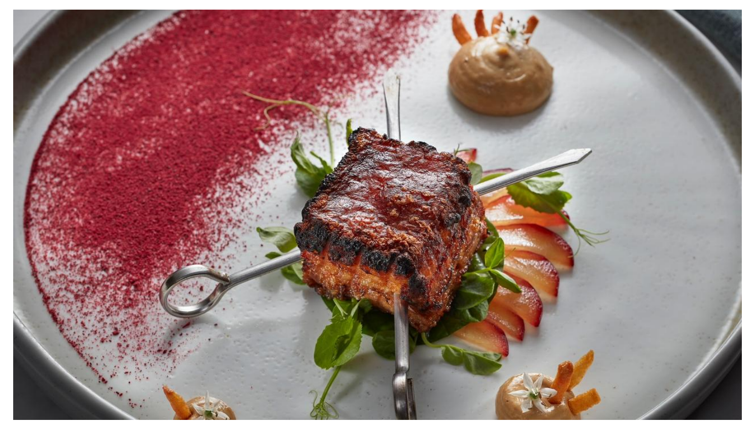
Microgreens grown in the Mowbray Valley feature in a dish at Silky Oaks Lodge.

He continues to build relationships with local producers.