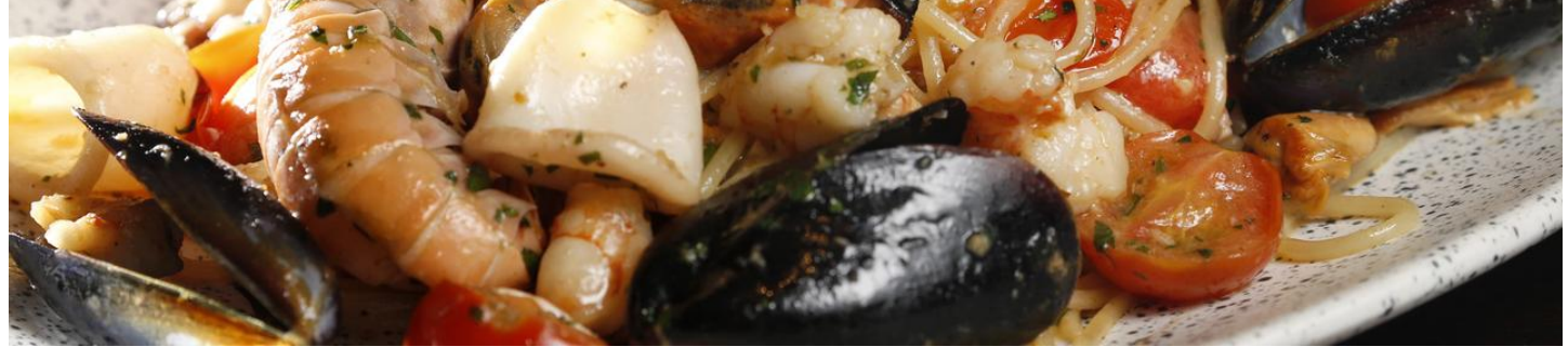
Villa Romana Trattoria's signature dish Spaghetti Allo Scoglio

Villa Romana's signature dish, Spaghetti Allo Scoglio, features sauteed crab, scallops, prawns, Moreton Bay bug, mussels, calamari, clams, cherry tomatoes, white wine and garlic.