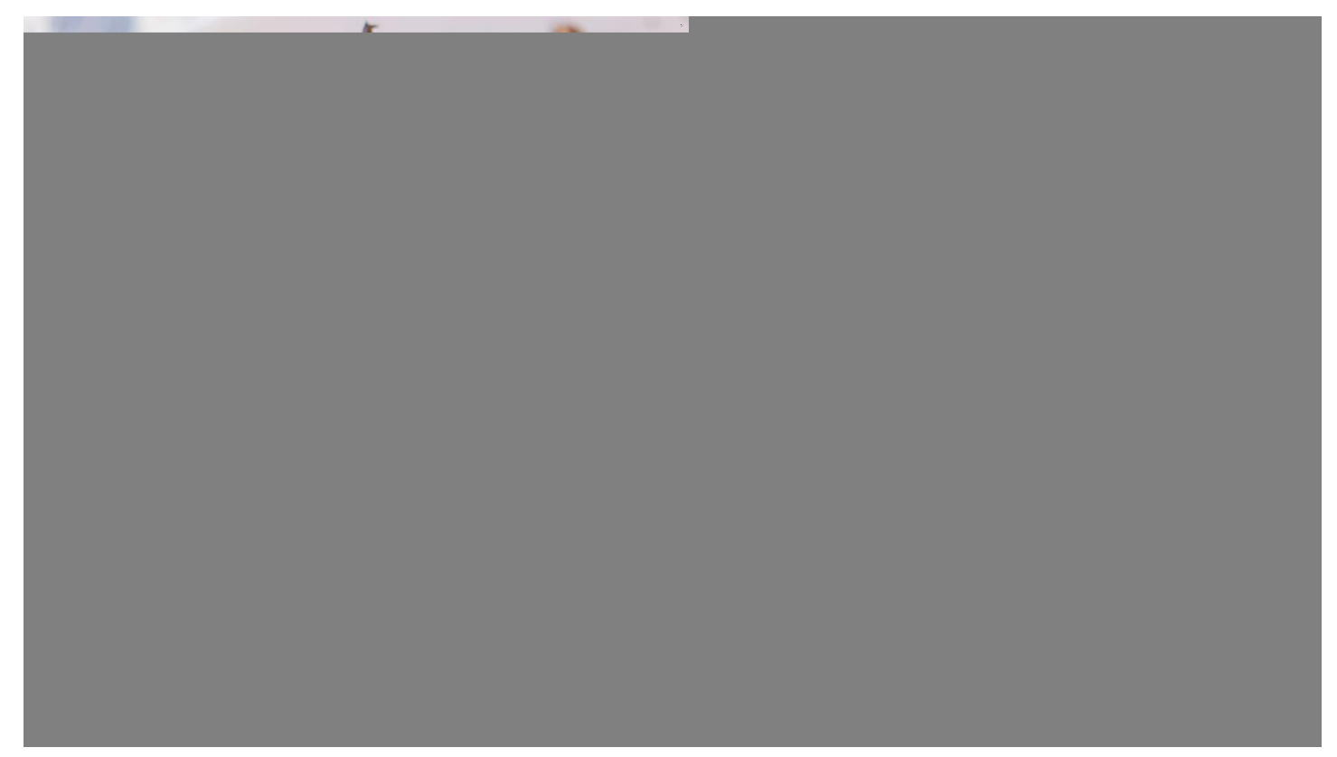
Making a 'splash' on the Esplanade, Splash Seafood has showcased some of the regions best seafood delights over the past 21 years.

From humble beginnings as a small fish cafe, Splash Seafood Restaurant on the Cairns Esplanade has witnessed resort complexes grow up around the CBD venue after opening its doors for the first time in 2002.