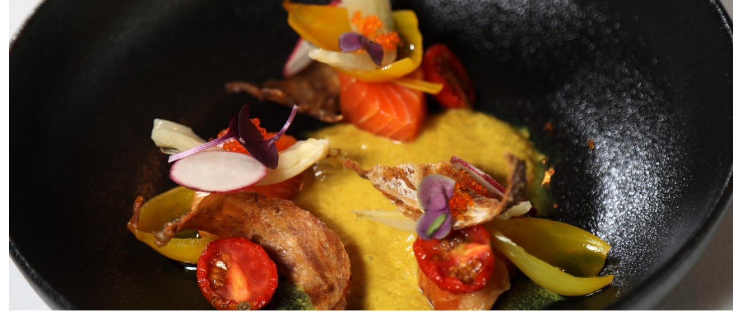
Fenugreek cured salmon, yellow onions, tarragon oil and fish roe at Tamarind.

It calls its food 'Australian freestyle cuisine', where styles, ingredients and techniques from other cultures are incorporated.