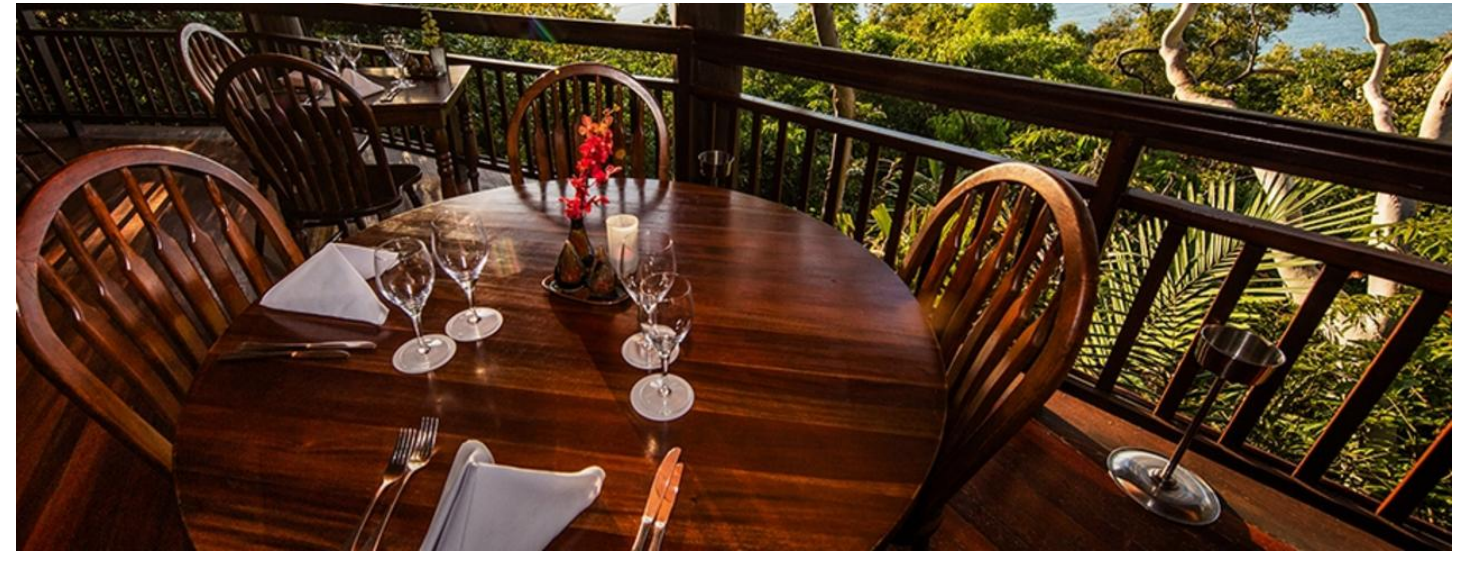
Ospreys Restaurant at Thala Beach Nature Reserve boasts sweeping views over the Coral Sea.

"We hope to discover more ways to support local and indigenous foods and techniques, Mr Miles said.