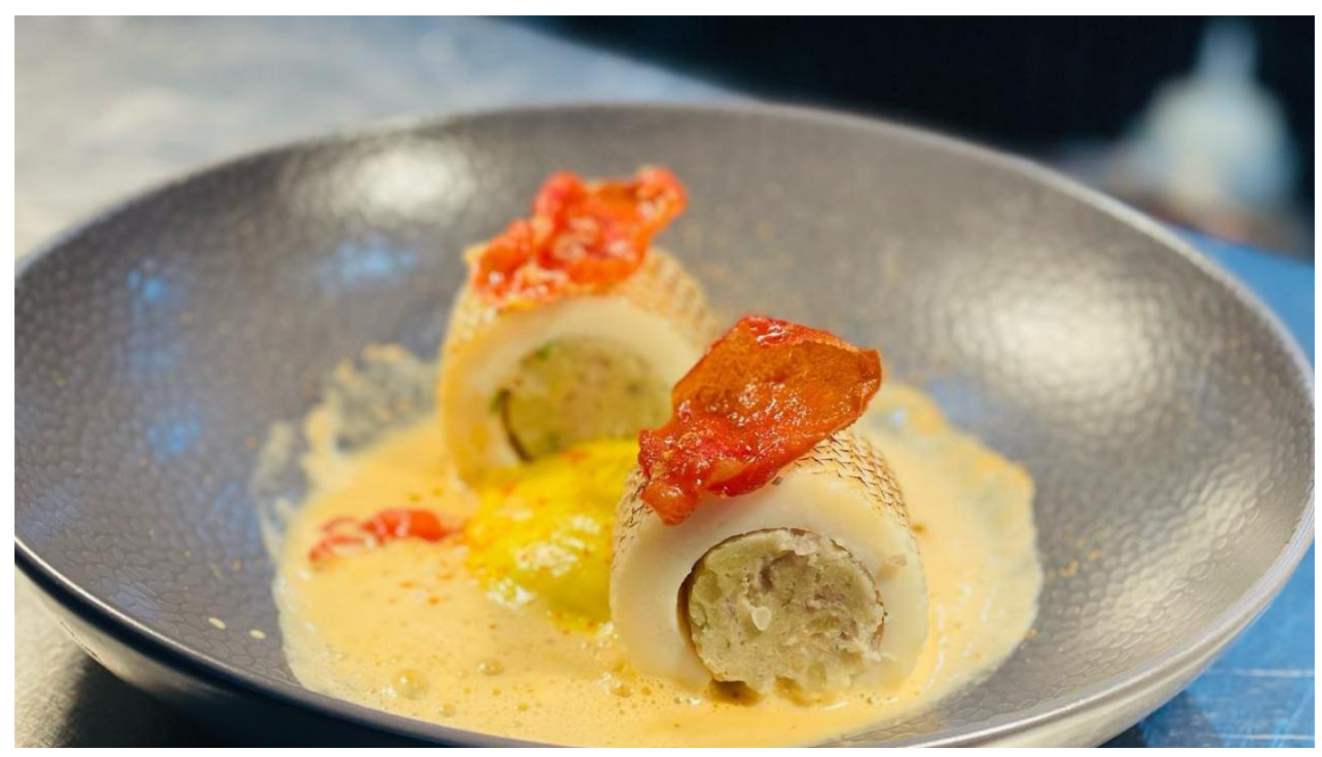
Stuffed calamari with potatoes and braised shallot on a saffron besciamelle, prawns bisque and crunchy prosciutto at Il Chiosco at Trinity Beach.

His favourite pizza is the potato and Italian sausage pizza.