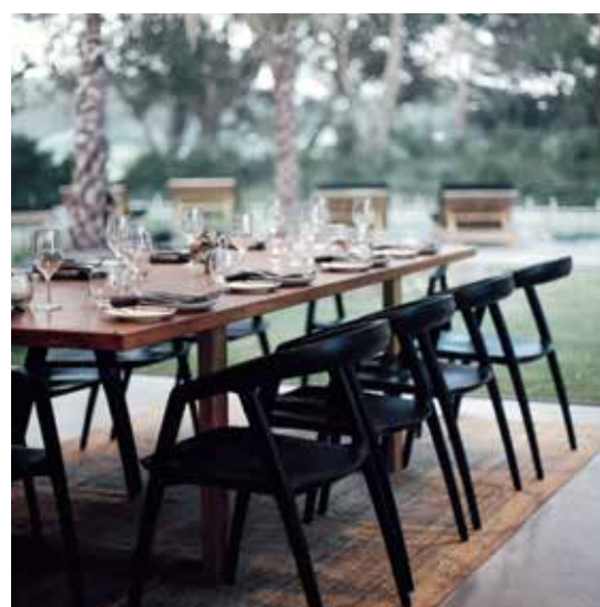
Bangalay Dining, the fine-dining restaurant at Bangalay Villas in Shoalhaven Heads.