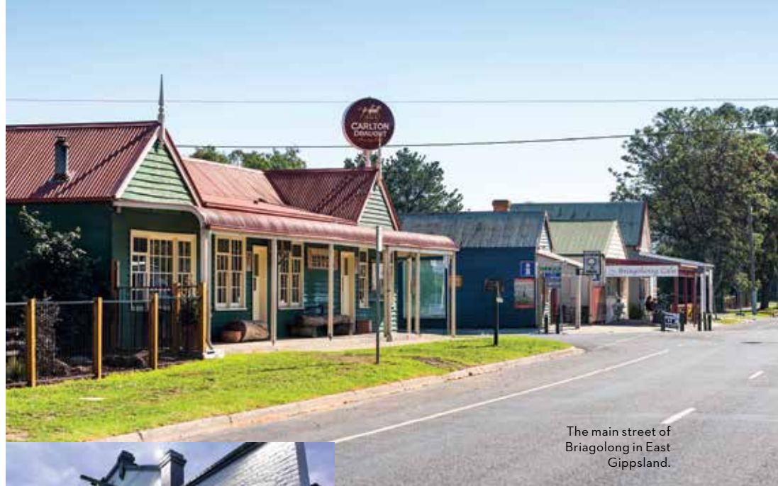
The main street of Briagolong in East Gippsland.

The long beaches of Victoria's Lakes Entrance and the surrounding towns of Bairnsdale and Lindenow were spared from the firefronts that famously threatened communities such as Mallacoota, further along the coast. Stay at The Riversleigh in Bairnsdale ( www.riversleigh.com.au ) and pop next door to The Loft restaurant, which champions East Gippsland produce, as does the nearby Northern Ground (northernground.com.au). Ferryman's Seafood Cafe, housed in an old car ferry on the waterfront at Lakes Entrance ( www.ferrymans.com.au ), showcases the coast's famous seafood. And Toms Cap Vineyard Retreat in Willung South, Central Gippsland ( www.tomscap.com.au ) is also a great option as a base for exploring the region.