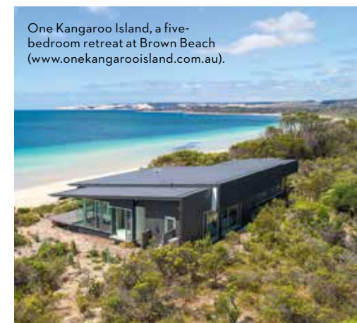
One Kangaroo Island, a five-bedroom retreat at Brown Beach ( www.onekangarooisland.com.au ).

We're very conscious that this story is not all about us at Southern Ocean Lodge, but about the KI community as a whole