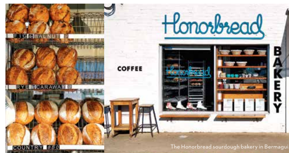
The Honorbread sourdough bakery in Bermagui.