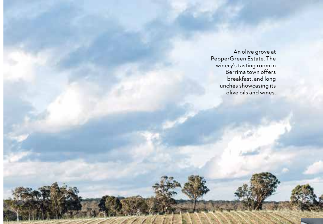
An olive grove at PepperGreen Estate. The winery's tasting room in Berrima town offers breakfast, and long lunches showcasing its olive oils and wines.

This picturesque country New South Wales destination, a 90-minute drive from Sydney, has long been a foodie and wine-lover's haven. While fires burnt through large areas of Nattai National Park and bushland bordering Kangaroo Valley, the main tourist areas from Bowral to Robertson remained intact and open for business. Stay in chic cottages at Berrima's Bendooley Estate ( www.bendooleyestate.com.au ) and sample cool-climate wines at PepperGreen Estate's cellar door and tasting room in Berrima town ( peppergreenestate.com.au ). Then head to the Shaggy Cow cafe in Mittagong for lunch ( www.theshaggycow.com.au ), and Biota in Bowral ( www.biotadining.com ) for a sublime dinner.