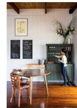
Kangaroo Island's Kingscote Jetty. Left: Sunset Food & Wine at Kangaroo Head ( www.sunsetfoodandwine.com ).