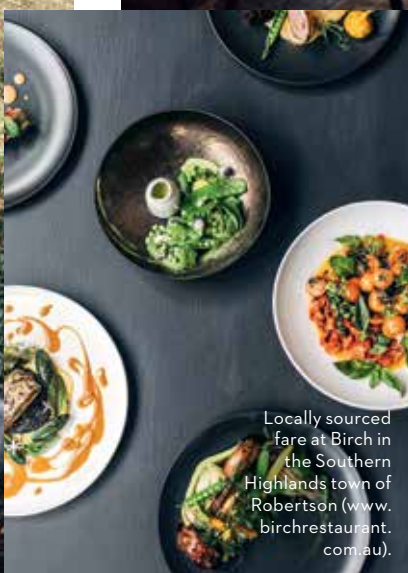
Locally sourced fare at Birch in the Southern Highlands town of Robertson ( www.birchrestaurant.com.au ).