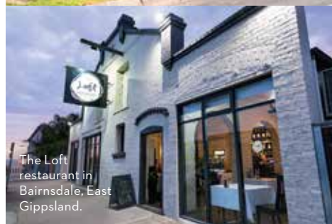
The Loft restaurant in Bairnsdale, East Gippsland.