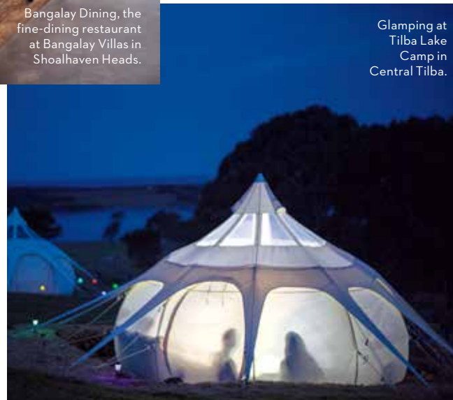
Glamping at Tilba Lake Camp in Central Tilba.