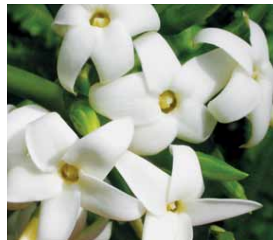
top left: Trekking to Mt Gower top right: Cloud Forest, Mt Gower bottom right: Unique flora

Lord Howe's most popular walk takes you to Malabar Hill and Kims Lookout, with its commanding views up the spine of the island to Mt Gower. The trail starts on Neds Beach Road, then passes through a stand of kentia palms shading shearwater breeding burrows. After climbing to Malabar Spur, you'll emerge at the top of Malabar Hill, where the cliffs plunge straight down to the ocean. The crannies in the cliffs shelter one of the world's largest nesting sites for red-tailed tropic-birds, which put on a mesmerising aerial display between September and May. If you extend your walk to the more challenging Kims Lookout, you'll be rewarded with views across The Lagoon to the southern tip of the island. Continuing along the ridge, you'll reach Old Settlement Beach.