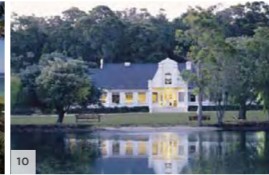
CAPE LODGE Margaret River, Western Australia