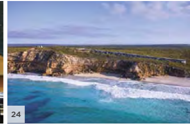
SOUTHERN OCEAN LODGE Kangaroo Island, South Australia