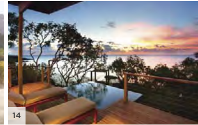
LIZARD ISLAND Great Barrier Reef, Queensland