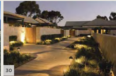
THE LOUISE Barossa Valley, South Australia