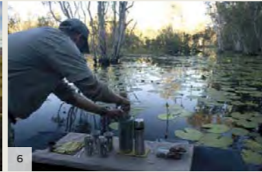
BAMURRU PLAINS Top End, Northern Territory