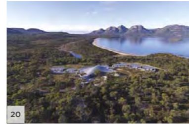
SAFFIRE Freycinet, Tasmania