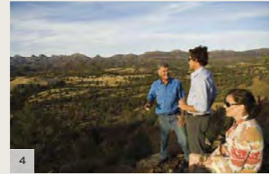
ARKABA STATION Flinders Ranges, South Australia