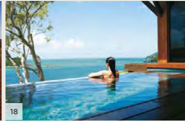
QUALIA Great Barrier Reef, Queensland