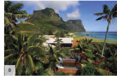
CAPELLA LODGE Lord Howe Island, New South Wales