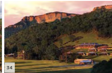
WOLGAN VALLEY RESORT & SPA Blue Mountains, New South Wales