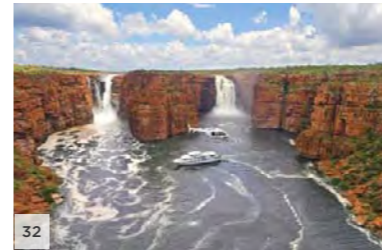
TRUE NORTH The Kimberley, Western Australia