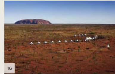
LONGITUDE 131° Ayers Rock (Uluru), Northern Territory