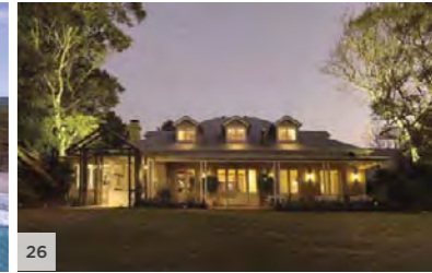
SPICERS CLOVELLY ESTATE Sunshine Coast Hinterland, Queensland