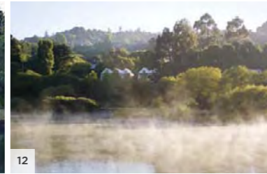
LAKE HOUSE Daylesford, Victoria