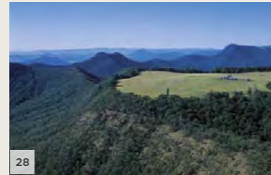
SPICERS PEAK LODGE Scenic Rim, South East Queensland