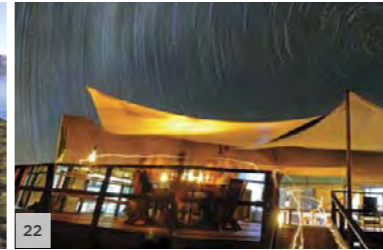
SAL SALIS Ningaloo Reef, Western Australia